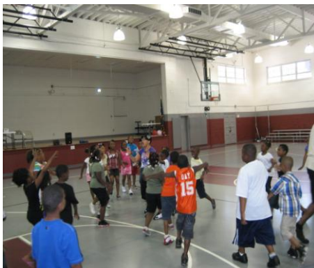
Students enrolled in the summer computer program participate in the new fitness craze Zumba .