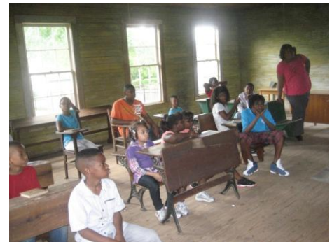
Children enrolled in the summer program visits the Mays Historical Site.