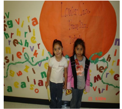
The Lower Case Pumpkin Patch at the Edgefield Center.