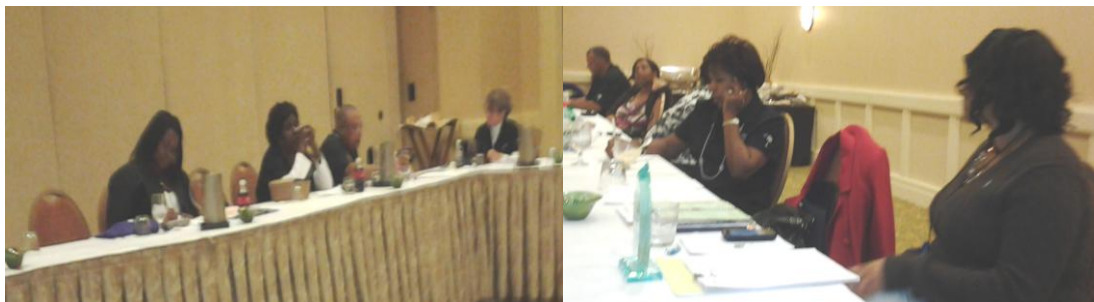
GLEAMNS Board of Commissioners held its bi-monthly board meeting on Thursday evening at the Statewide Retreat at Wild Dunes Resort, Isle of Palms, SC.

GLEAMNS Board of Directors, Executive Staff, and Policy Council Chairperson recently attended the Statewide Board Retreat in Isle of Palms, South Carolina.