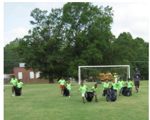
Children participate in the end of the summer activities.