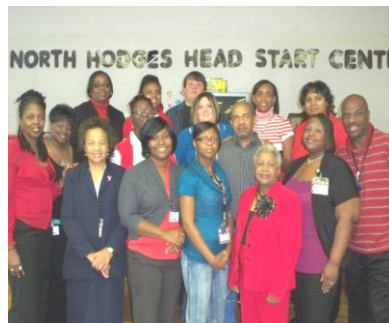
North Hodges Head Start staff gathers for a photo.