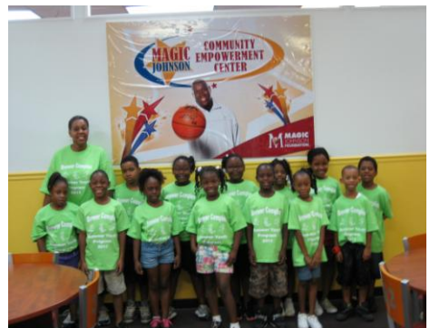
Third graders enrolled in the summer computer class.