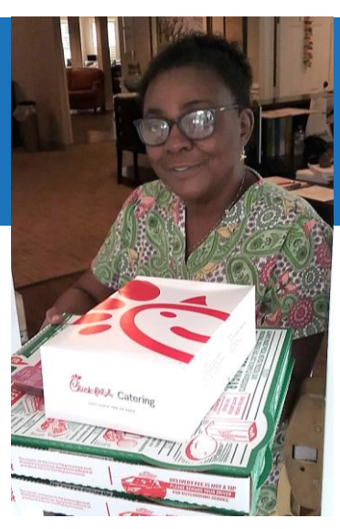
Morningside of Greenwood staff receiving lunch delivery.