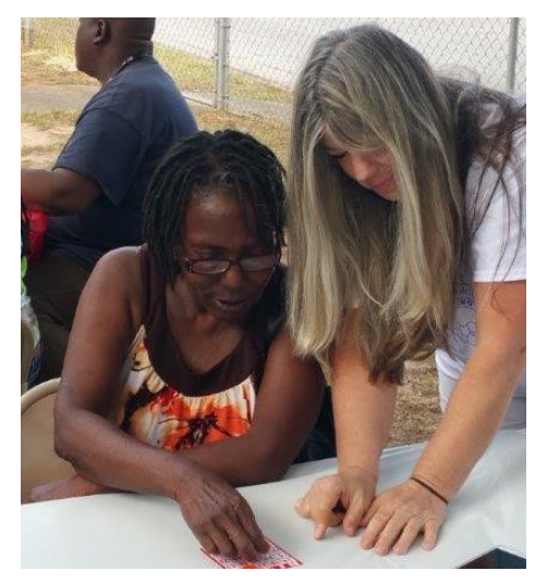
GLEAMNS staff assisting customer with bingo.

Please check out our agency website at <u>www.gleamnshrc.org</u> to view an upcoming special edition of the GLEAMNS Community Services newsletter, which will include highlights of 2020 and a look-back at the 'year before the pandemic' (2019). Moments from Community Action Day 2021 will be posted online at a later time. This newsletter will be posted online as well.