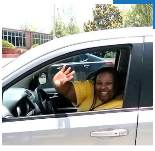
Customer thanking staff as she drives through!