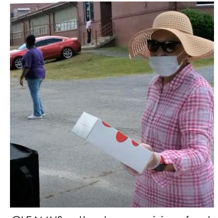
GLEAMNS attendee receiving food box item.