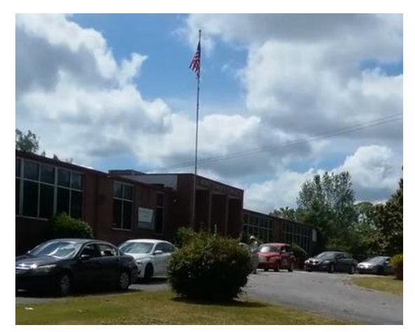
Cars lining up for start of Community Action Day.

Please see page 7 for more photos from our 2020 Community Action Day event!