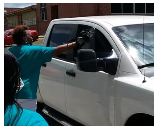
GLEAMNS staff handing resource bag to customer.