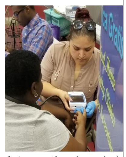
Customer getting glucose levels checked by representative of La Clinica Gratis.