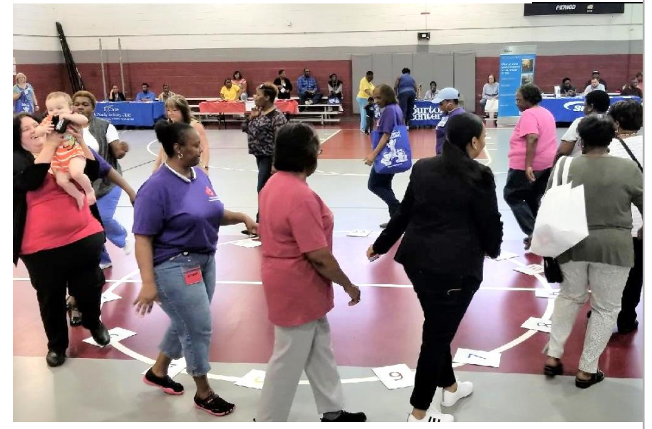
Participants "walking it out" during the Community Action Day's cakewalk.

GLEAMNS Community Services Dept. 301 N. Hospital Street