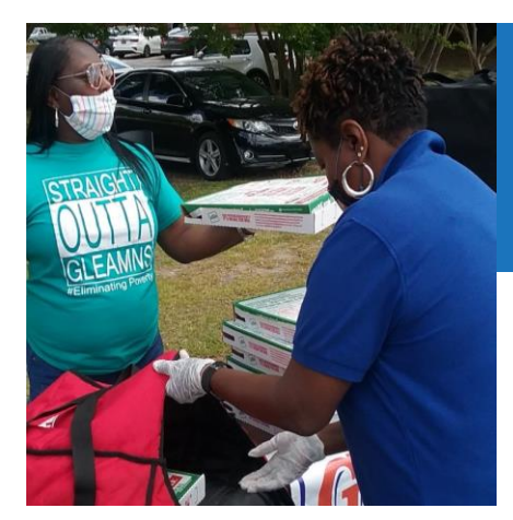
GLEAMNS staff preparing to hand out food items to drivers.