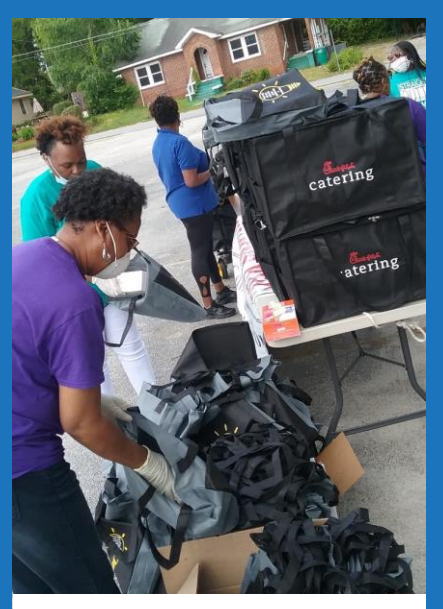
GLEAMNS staff organizing resource bags for handout.