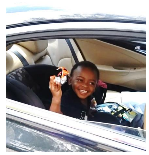
Young attendee smiling for the camera!