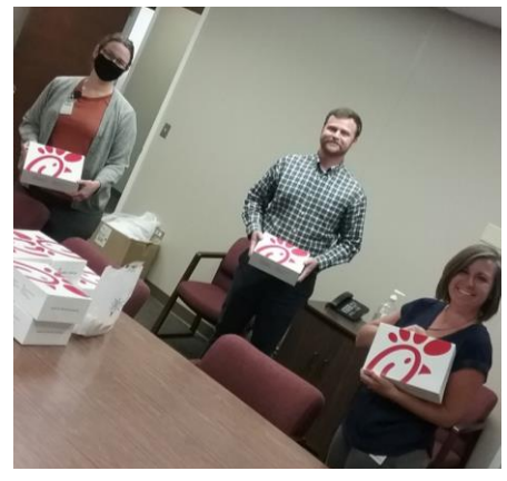
Smiles from City of Greenwood staff after lunch delivery!