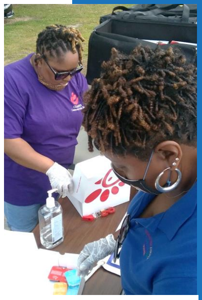
GLEAMNS staff preparing food box