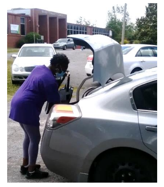
GLEAMNS staff placing food item and resource bag in customer's trunk.