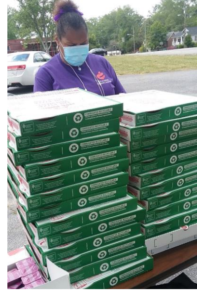
GLEAMNS staff organizing food items for handout.