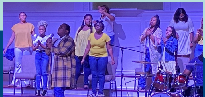
Musical Guests Minorities On the Move Gospel Choir (Lander University)